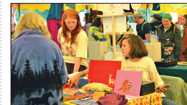
YEZ Tent.